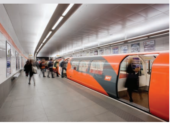
Hillhead Station platform