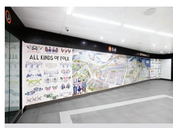
Alasdair Gray mural at Hillhead Subway Station

Covered walkways link the state-of-the-art station building to the 17 local bus and coach stance areas and also extend to the rail station and taxi area. To enhance awareness of the interchange options between the bus station, Hamilton Central railway station and taxi rank, improved signage and information provision was provided.